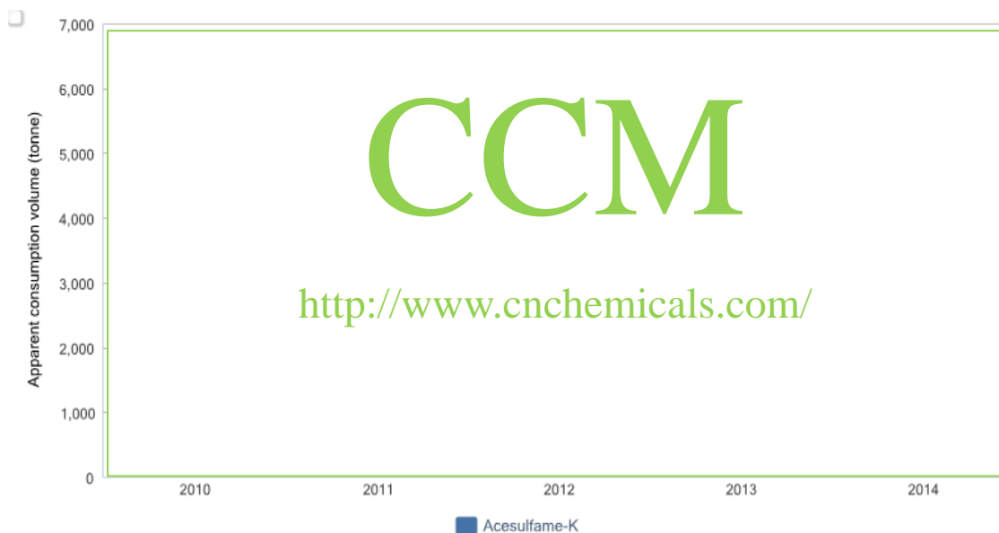
Figure 1.1.1-1 Apparent consumption of acesulfame-K in China, 2010-2014

In China, acesulfame-K is mainly used in the food and beverage industries ...